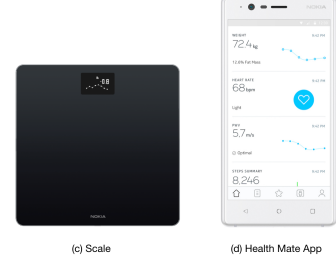
Figure 1: Nokia devices used: (a) Activity Tracker Watch collects number of steps, walking speed and distance, number of calories. sleep duration, light and deep sleep, (b) Aura Sleep Tracker records sleep duration, rapid eye movement, light and deep sleep, time awake at night, time to fall asleep, number of times awaken, time to be awake, bed in time, bed out time, nightly heart rate and respiratory rate. (c) Scale measures weight, body fat and water percentage, muscle mass and bone mass. (d) Health Mate App provides users' access to data and periodic questionnaires.