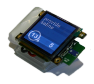
Fig. 3. Micro display prototype with a physical size of 51mmx30mm

As mentioned above, our major design issues are low energy consumption and wireless connectivity. For high-resolution display devices that are always on, power consumption of the display is