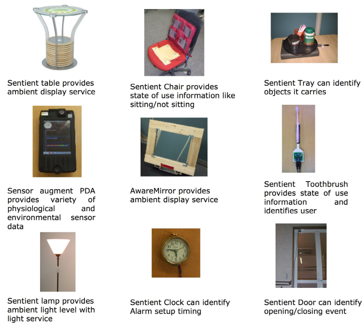
Fig. 1. Array of Sentient Artefacts

Sentient artefact is a mere everyday object without any noticeable features. We augment sensors to it to make it aware of its environment. By doing so we extend its functional advantages as it can provide value added services beyond its primary role. For example, consider a chair, it is primarily used for sitting. We can put a few sensors on it and we can identify when it is used or even who is using it. So from the functional point of view, a mere chair now serves as a source of context information of an entity. But it does not conflict with its primary role of providing support for sitting. This is the basic concept of sentient artefact; keeping its primary role intact as an artefact while allowing it to provide additional services. In the case of the chair it can provide its state of use, and if we know the identity of the person we can infer that the person is sitting (activity) and he/she is at a specific location(chair's location). In Figure 1 we show some of the sentient artefacts that we have developed.