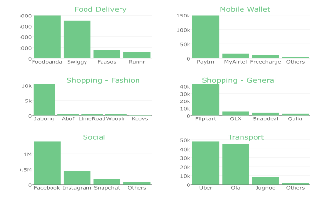
Figure 2: Distribution of Application Usage Duration

It is evident that mere installation of competing applications does not imply a proportionate usage. In fact, over 80% of sessions in the Mobile Wallet and Shopping - Fashion categories were attributed to only one application. The same is true for 78.8% of sessions in Shopping - General and 66.66% of those in Social. A slightly more competitive scenario was observed with 2 applications contributing the ma-