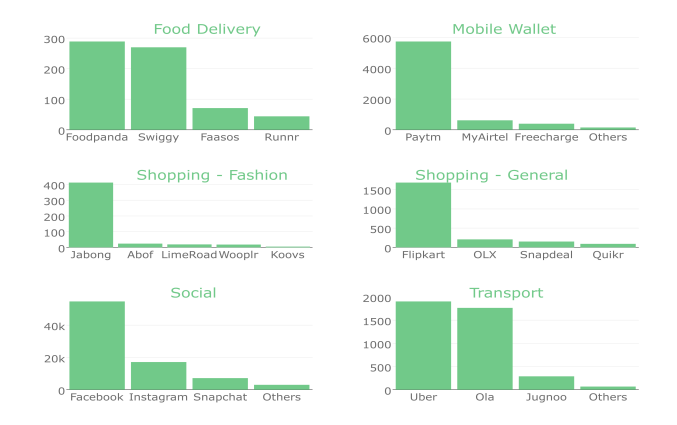
Figure 1: Distribution of Application Sessions

for installation of multiple competing applications. It was observed that 190 users (88.4%) had more than one application installed from each of the six app categories under consideration. Further, 76 users (35.3%) had three or more apps installed from each category.