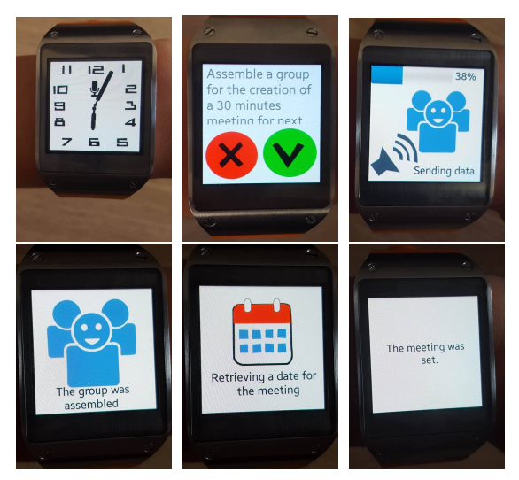
Figure 2. The program flow for the meeting creator. The task represented here is the creation of a meeting for next week with everyone present in the room.

manage several calendars often gets cluttered, even on the desktop, and even more so on mobile devices. Our concept tackles these issues and is designed to plan a meeting with nearby people in a short amount of time. One user initiates the process of finding a common timeslot, making his mobile device the master for this session (Figure 2). The other participants join the group by launching the adequate app on their smartwatch or smartphone. After the devices automatically formed a group, the master devices tries to determine a free common slot, which is then communicated to the remaining devices. The other participants finally just have to approve or reject the invitation. Before implementing this process in software, we performed a small evaluation with four users and paper prototypes, which brought us to include more detailed feedback on screen. The overall program flow was well received.